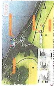
Spring Lake Park Master Plan