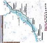
Minnesota Greenway Interpretive Plan