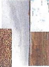
Black Dog Village