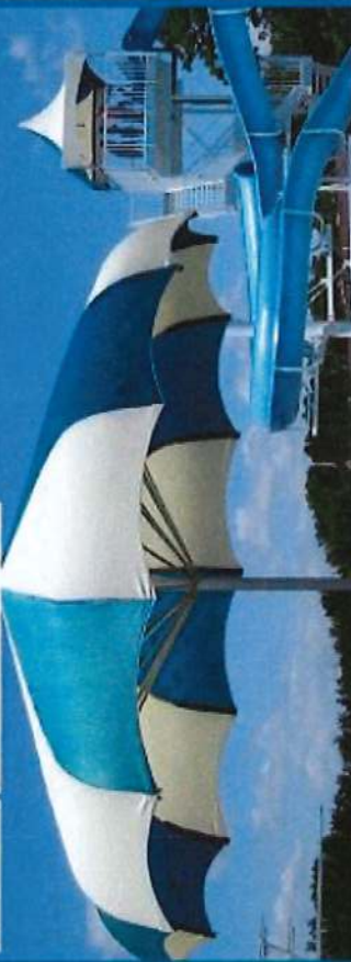
Catenary Curve Valance