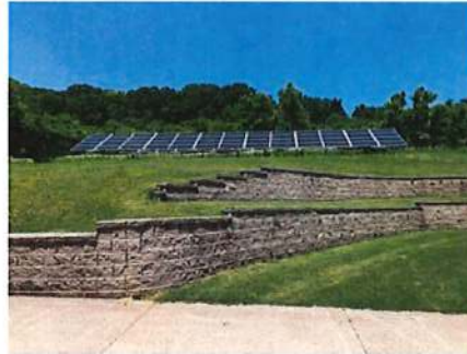
Radium Plant Solar Panels