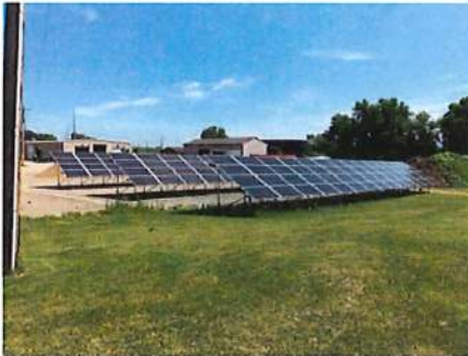
Maintenance Building (2 panels) Animal Shelter (1 Panel)

In 2019 the City of La Crescent installed 3 additional ground mounted solar PV systems. Those three systems provide power to the city radium plant, animal shelter, and maintenance building. Since installation in October of 2019 these three systems have produced 80,300 kWh of electricity. These systems are tied to the regional power grid (MISO) supplying power to the local buildings and excess power back onto the power grid. These three systems help provide power during peak grid demand, save money with reduced energy costs, and reduce carbon emissions from electricity generation.