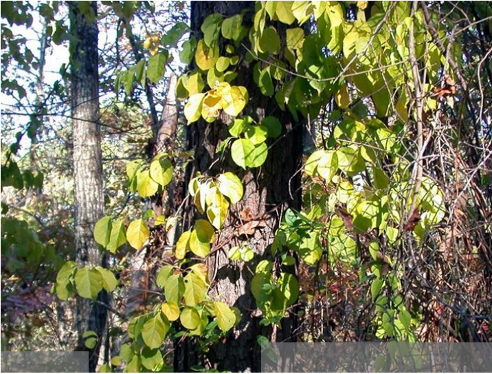
Round Leaf Bittersweet - An invasive vine