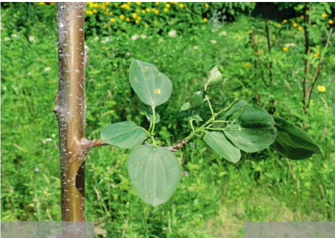
Buckthorn - An invasive small tree